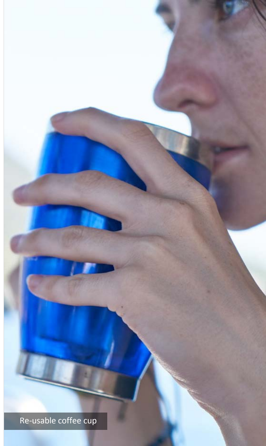
Re-usable coffee cup