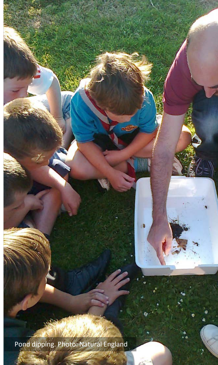
Pond dipping.