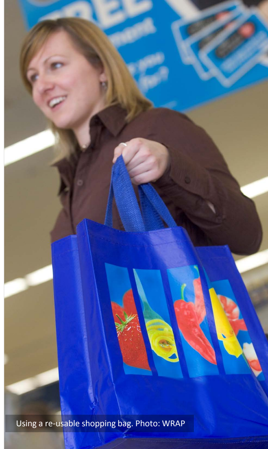
Using a re-usable shopping bag.