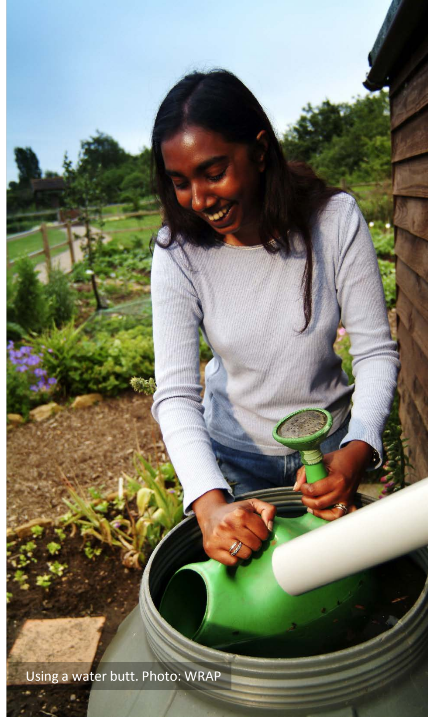
Using a water butt.

Register to receive future updates on the Year of Green Action.