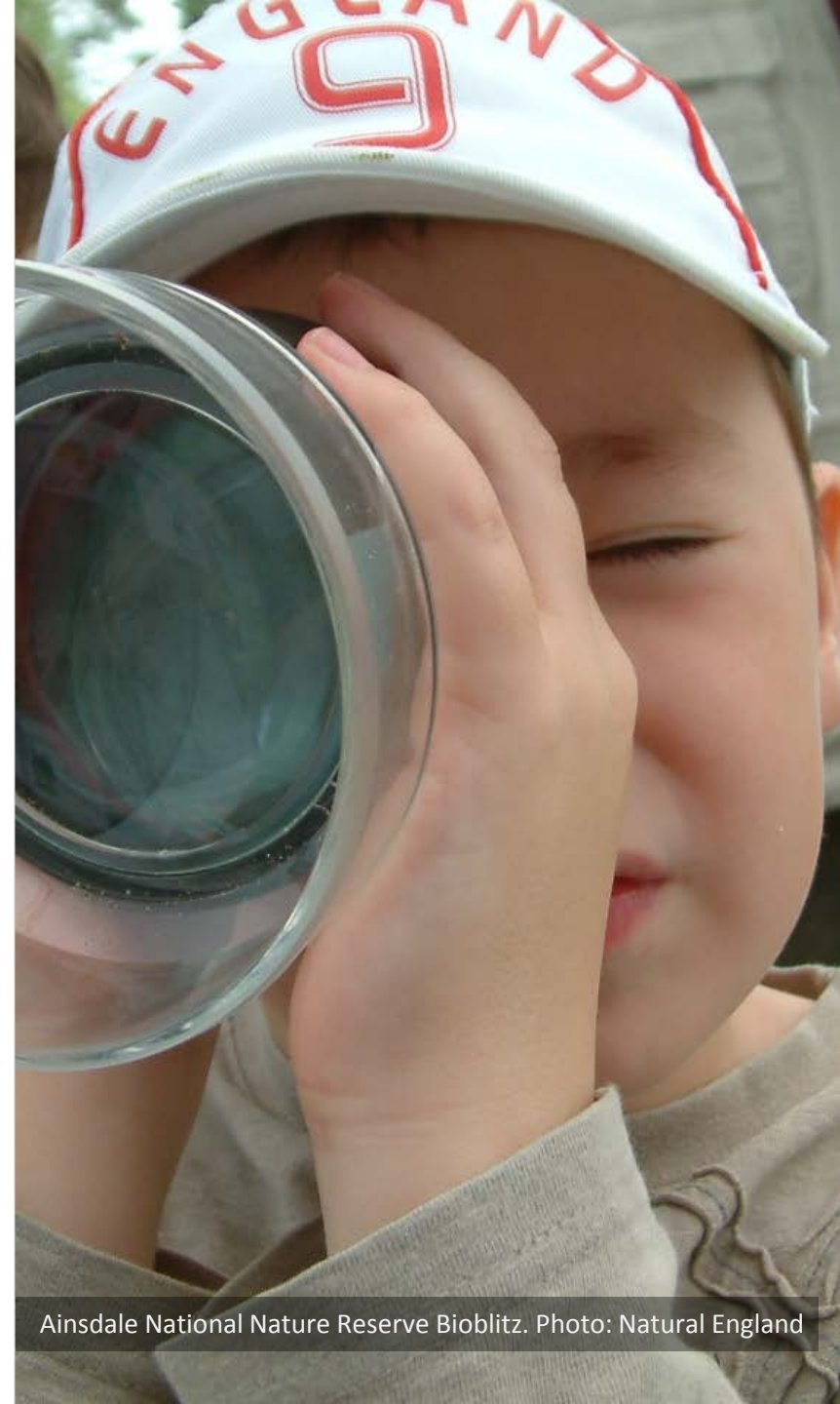
Ainsdale National Nature Reserve Bioblitz.

Where possible please include quotes, photographs or web links. We look forward to hearing from you .